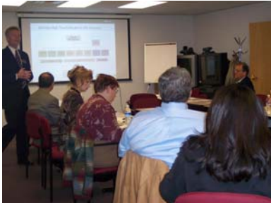
ZixCorp representatives provide one of three product demonstrations during a live, recorded session in December 2006.

state's pharmacies are certified by SureScripts and 50 percent are live on the network. NMPIC hosted four demonstrations of e-prescribing solutions in December 2006, featuring Zix and DrFirst as stand-alone providers and Allscripts and McKesson as potential EHR solutions.